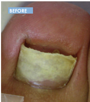
Figure 1. Patient's left foot